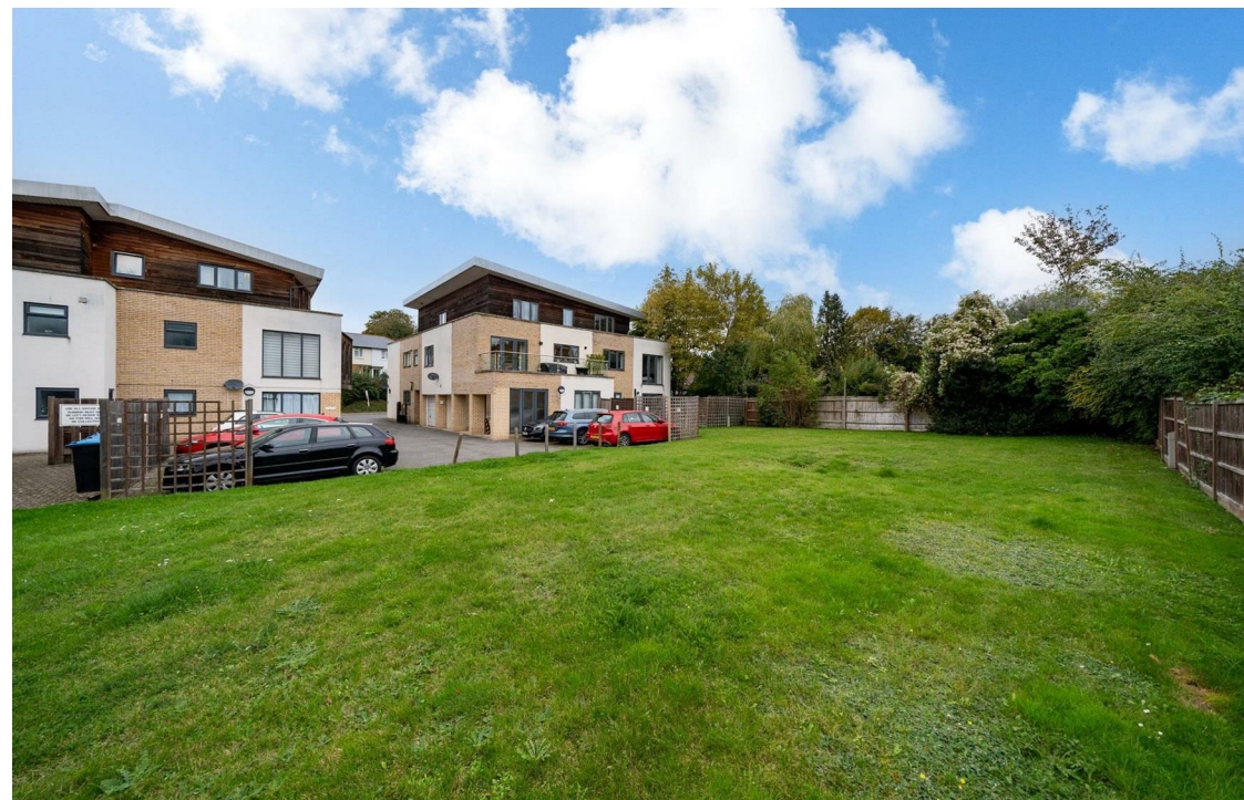
67 Marlowes, Hemel Hempstead, Hertfordshire, HP1 1LE 01442 233533 | www.squirestates.co.uk