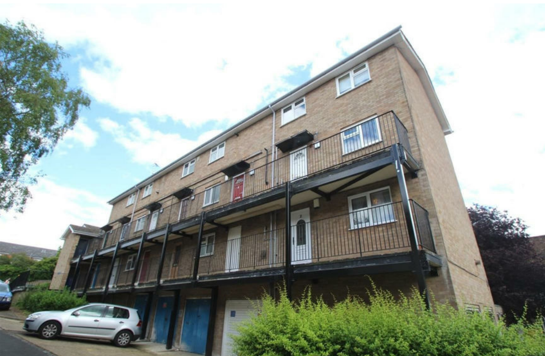
67 Marlowes, Hemel Hempstead, Hertfordshire, HP1 1LE 01442 233533 | www.squirestates.co.uk