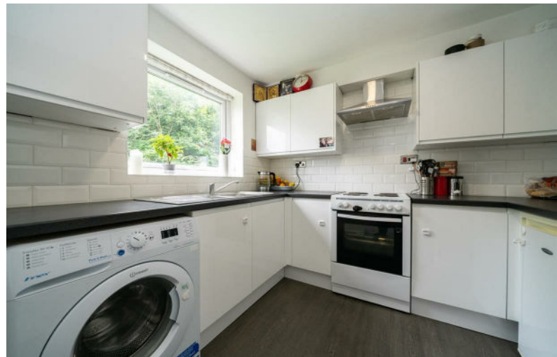
67 Marlowes, Hemel Hempstead, Hertfordshire, HP1 1LE 01442 233533 | www.squirestates.co.uk