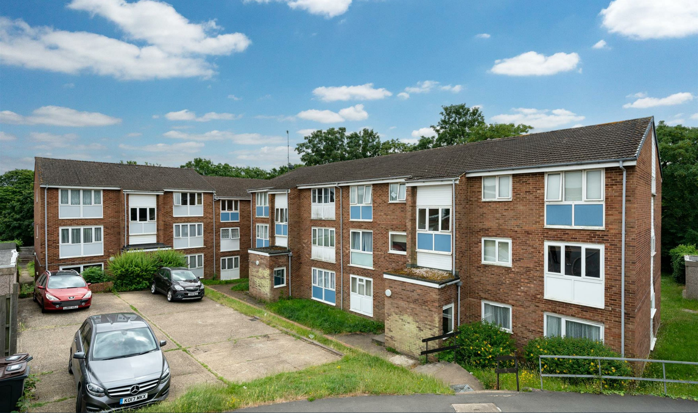
Kimpton Close Hemel Hempstead, HP2