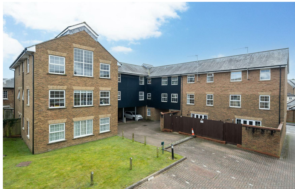
67 Marlowes, Hemel Hempstead, Hertfordshire, HP1 1LE 01442 233533 | www.squireestates.co.uk