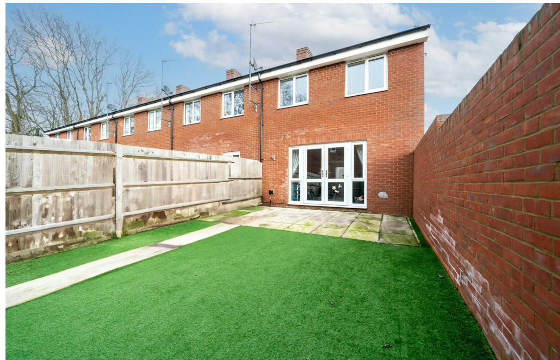
67 Marlowes, Hemel Hempstead, Hertfordshire, HP1 1LE 01442 233533 | www.squirestates.co.uk