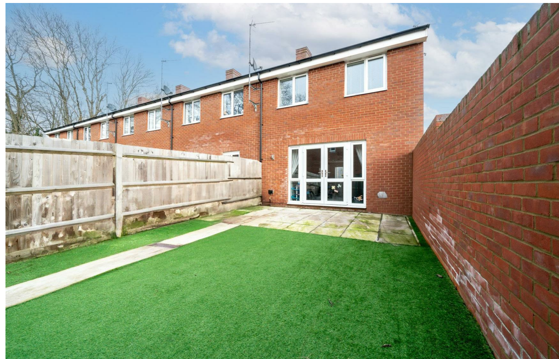
67 Marlowes, Hemel Hempstead, Hertfordshire, HP1 1LE 01442 233533 | www.squirestates.co.uk