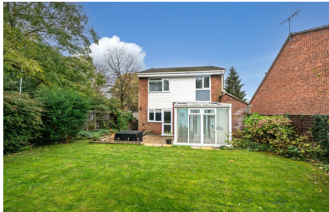
67 Marlowes, Hemel Hempstead, Hertfordshire, HP1 1LE 01442 233533 | www.squirestates.co.uk