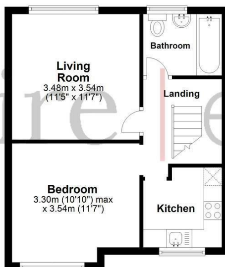
First Floor Approx. 38.6 sq. metres (415.3 sq. feet)