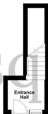
Ground Floor Approx. 4.6 sq. metres (50.0 sq. feet)