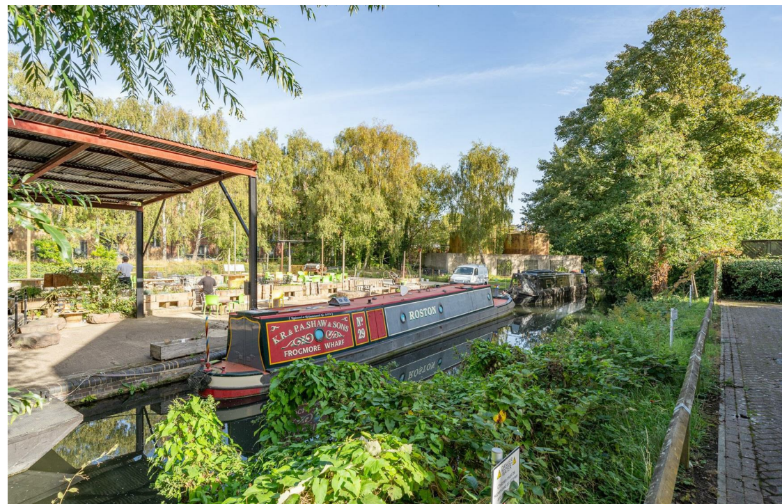
67 Marlowes, Hemel Hempstead, Hertfordshire, HP1 1LE 01442 233533 | www.squirestates.co.uk