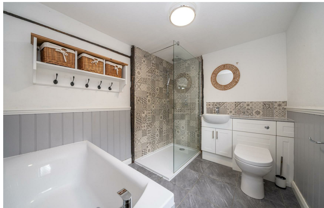
67 Marlowes, Hemel Hempstead, Hertfordshire, HP1 1LE 01442 233533 | www.squirestates.co.uk