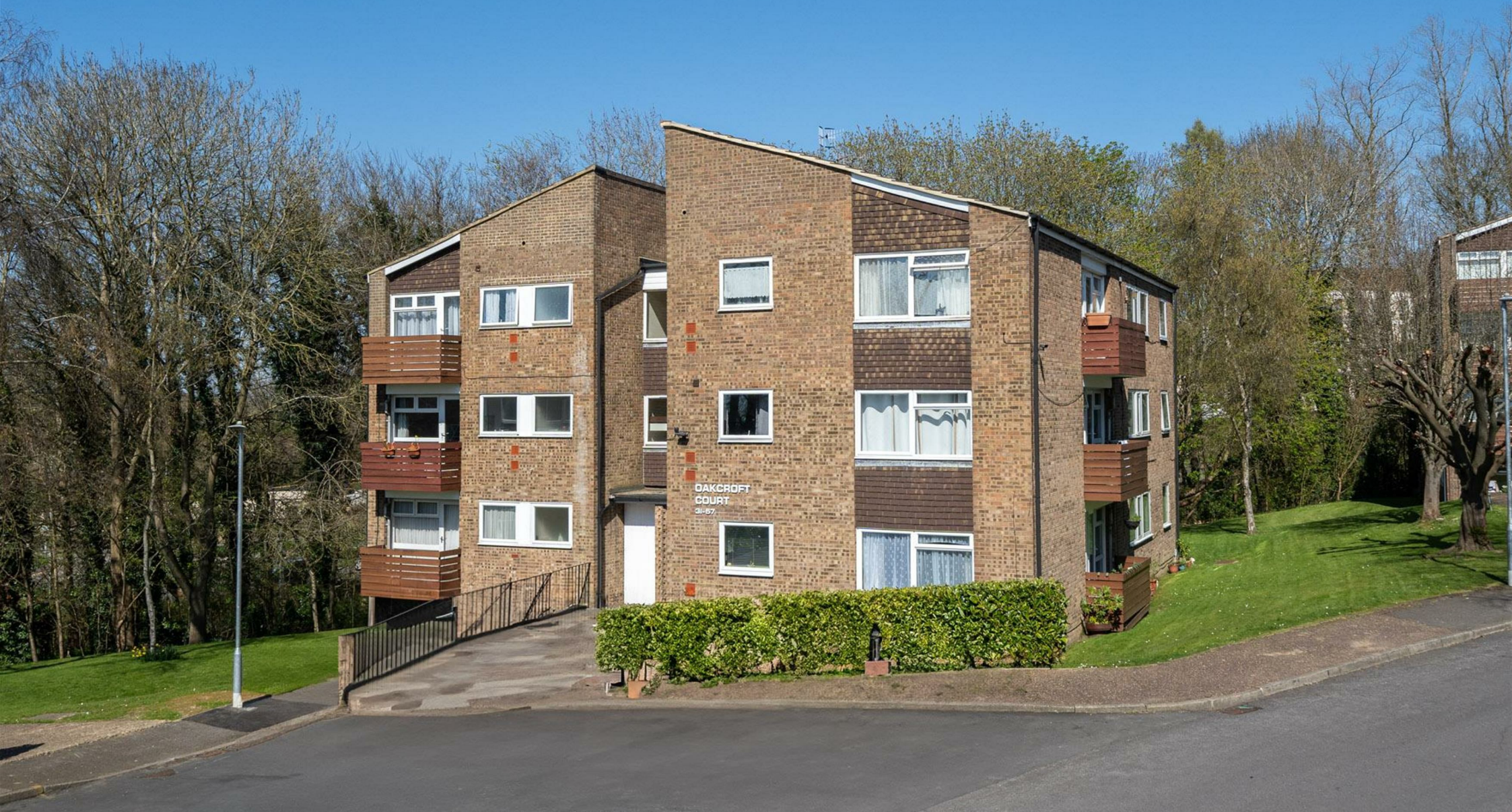
Oakcroft Court Hemel Hempstead, HP3 9EU