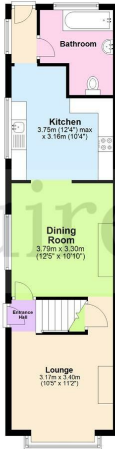
Ground Floor Approx. 55.7 sq. metres (599.8 sq. feet)