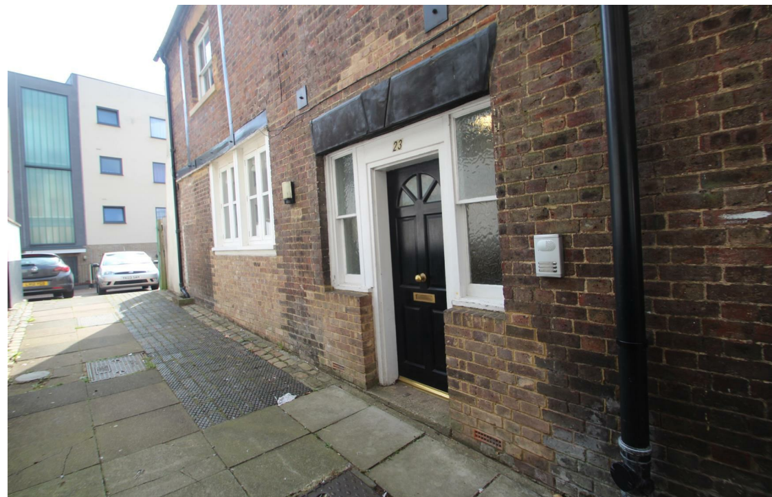
67 Marlowes, Hemel Hempstead, Hertfordshire, HP1 1LE 01442 233533 | www.squirestates.co.uk