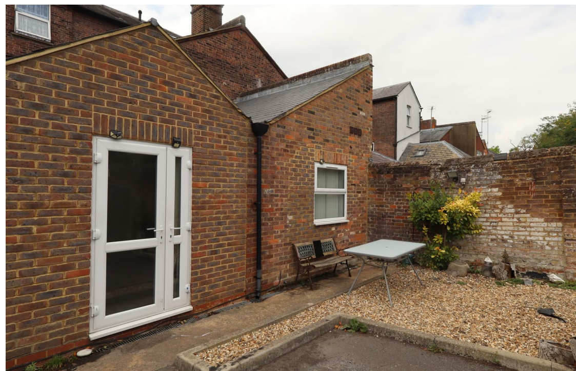
67 Marlowes, Hemel Hempstead, Hertfordshire, HP1 1LE 01442 233533 | www.squirestates.co.uk