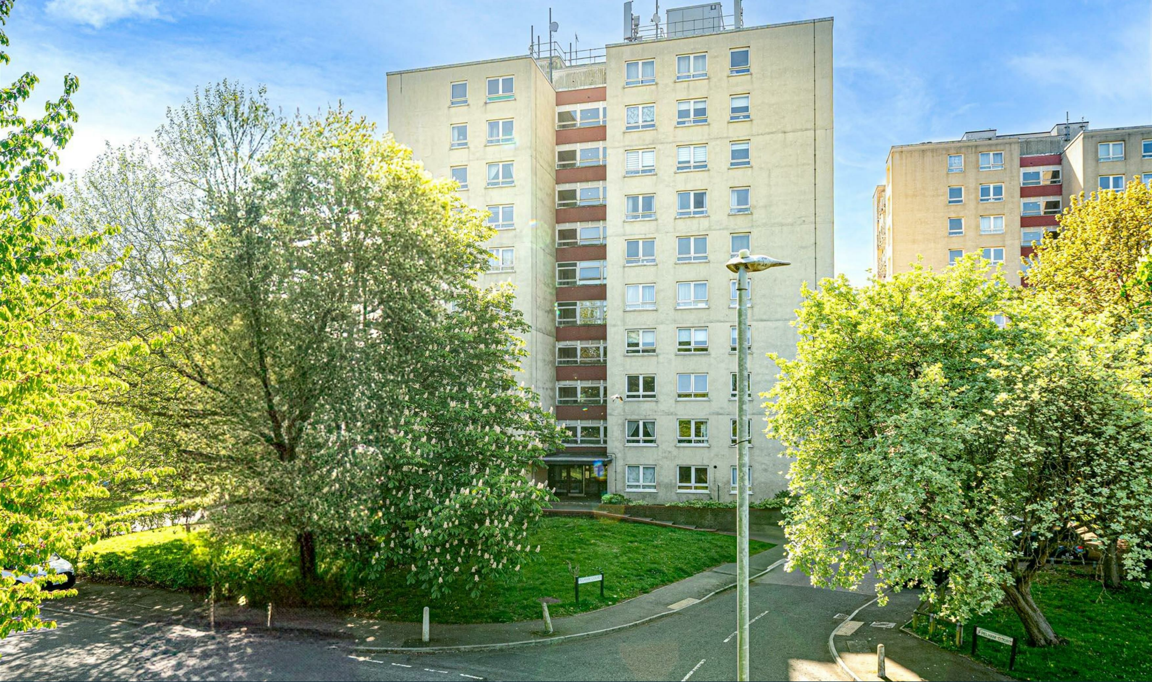
Pelham Court Hemel Hempstead, HP2 4UW