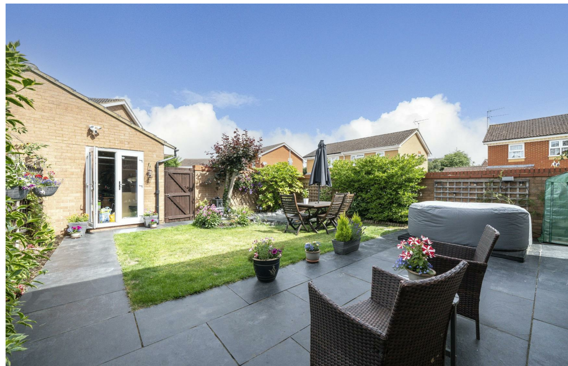
67 Marlowes, Hemel Hempstead, Hertfordshire, HP1 1LE 01442 233533 | www.squireestates.co.uk