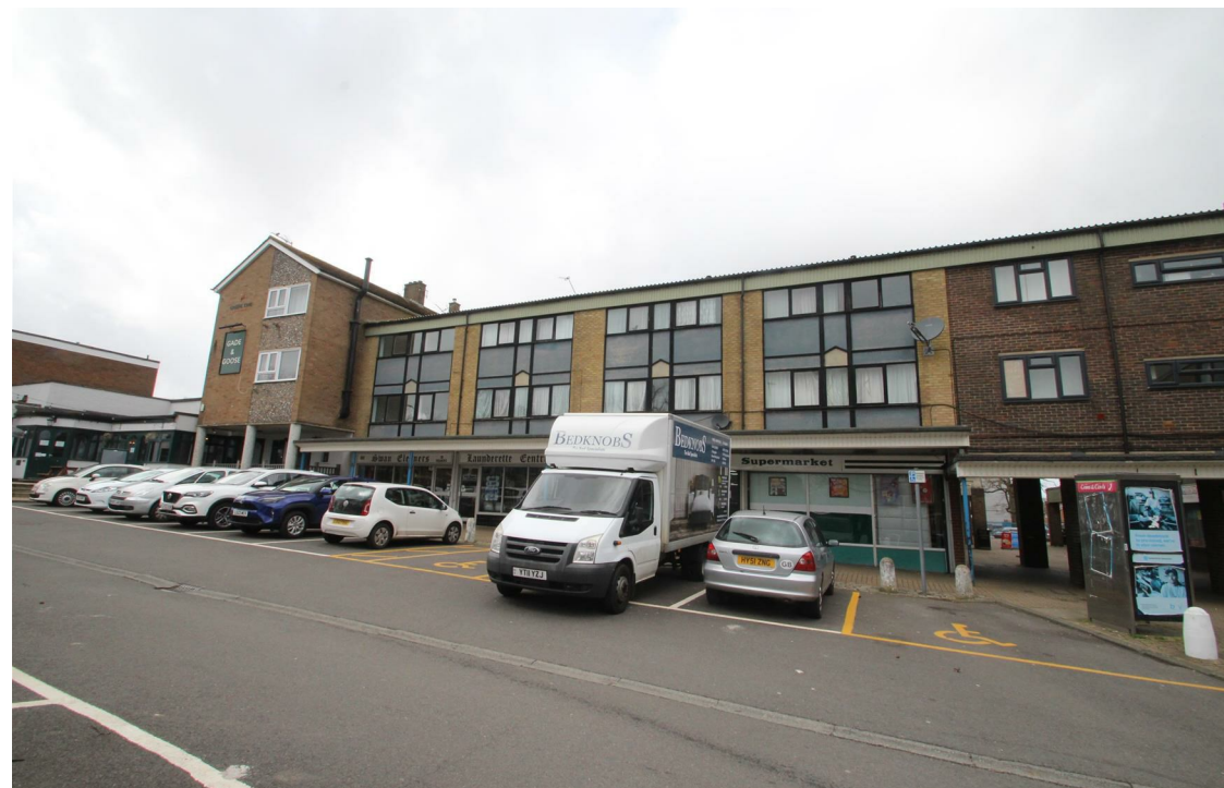
67 Marlowes, Hemel Hempstead, Hertfordshire, HP1 1LE 01442 233533 | www.squirestates.co.uk