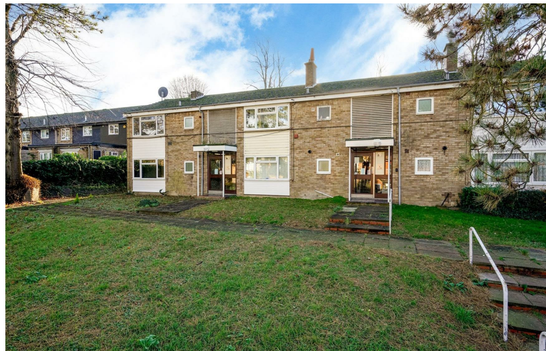
67 Marlowes, Hemel Hempstead, Hertfordshire, HP1 1LE 01442 233533 | www.squireestates.co.uk