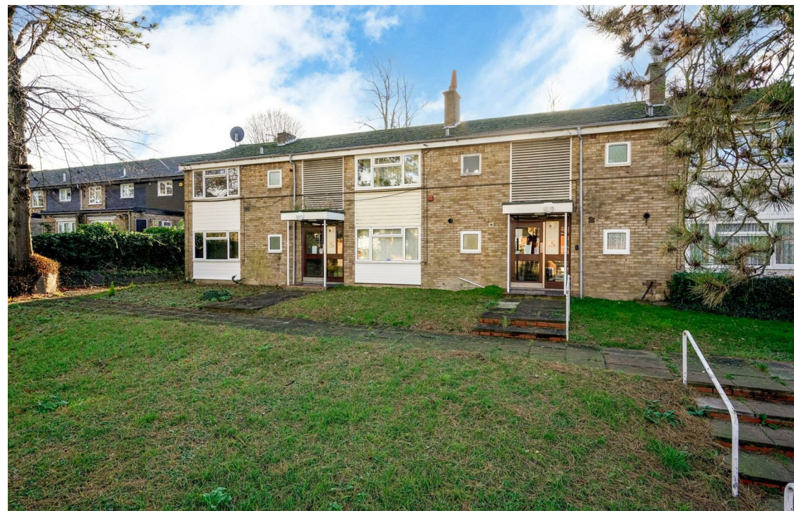
67 Marlowes, Hemel Hempstead, Hertfordshire, HP1 1LE 01442 233533 | www.squirestates.co.uk