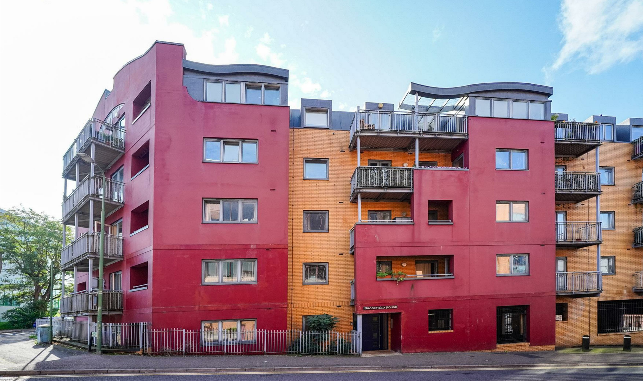
Brookfield House Hemel Hempstead, HP2 4FA