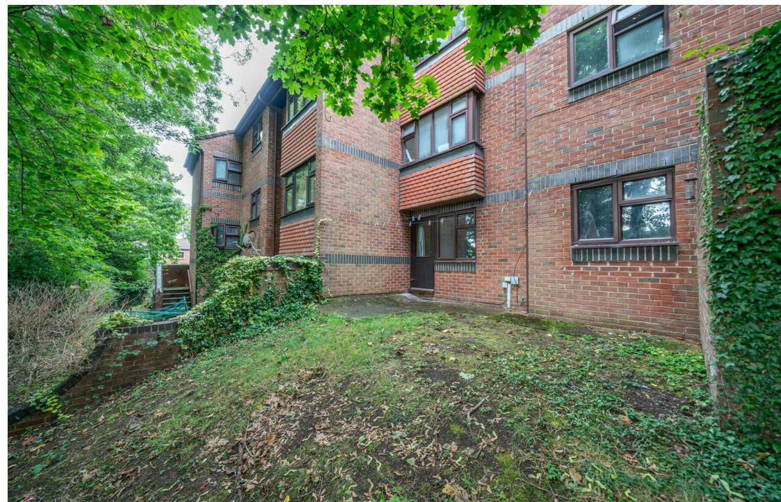
67 Marlowes, Hemel Hempstead, Hertfordshire, HP1 1LE 01442 233533 | www.squirestates.co.uk