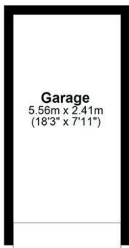
Garage 5.56m x 2.41m (18'3" x 7'11")