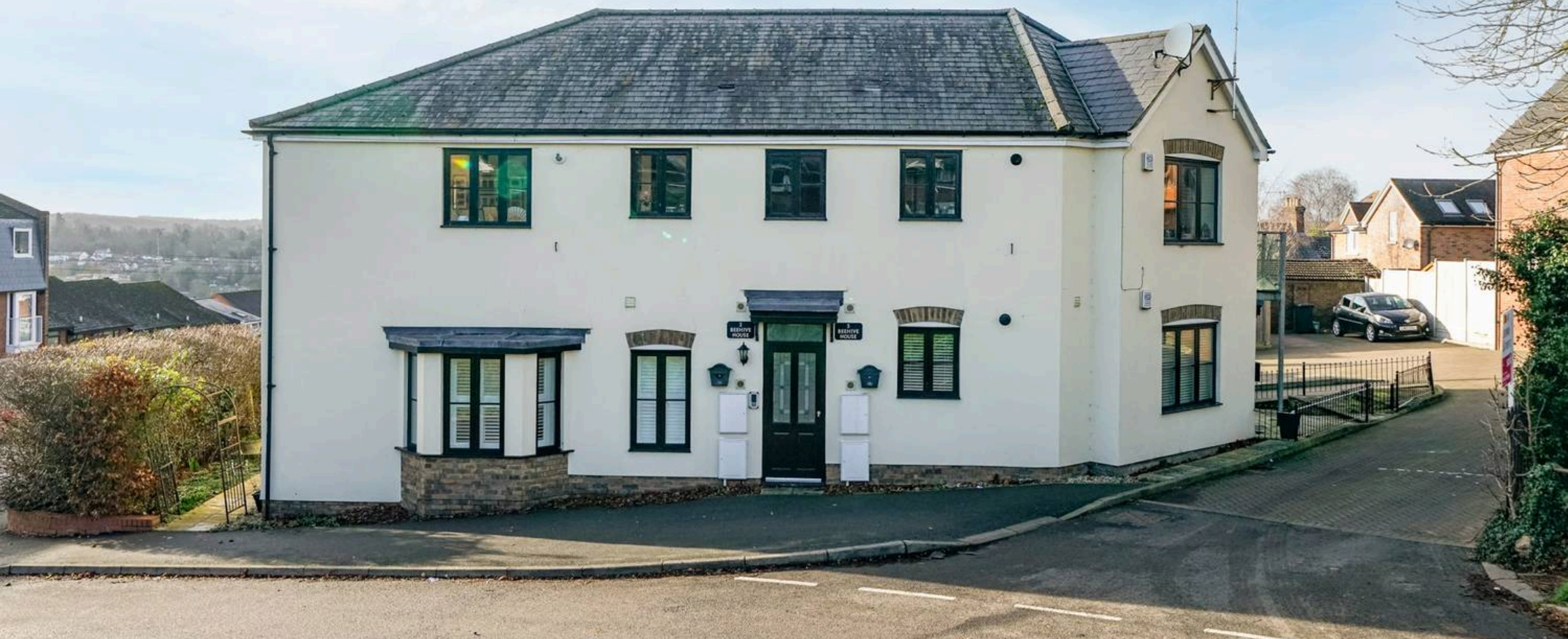
Beehive House Allandale, Hemel Hempstead