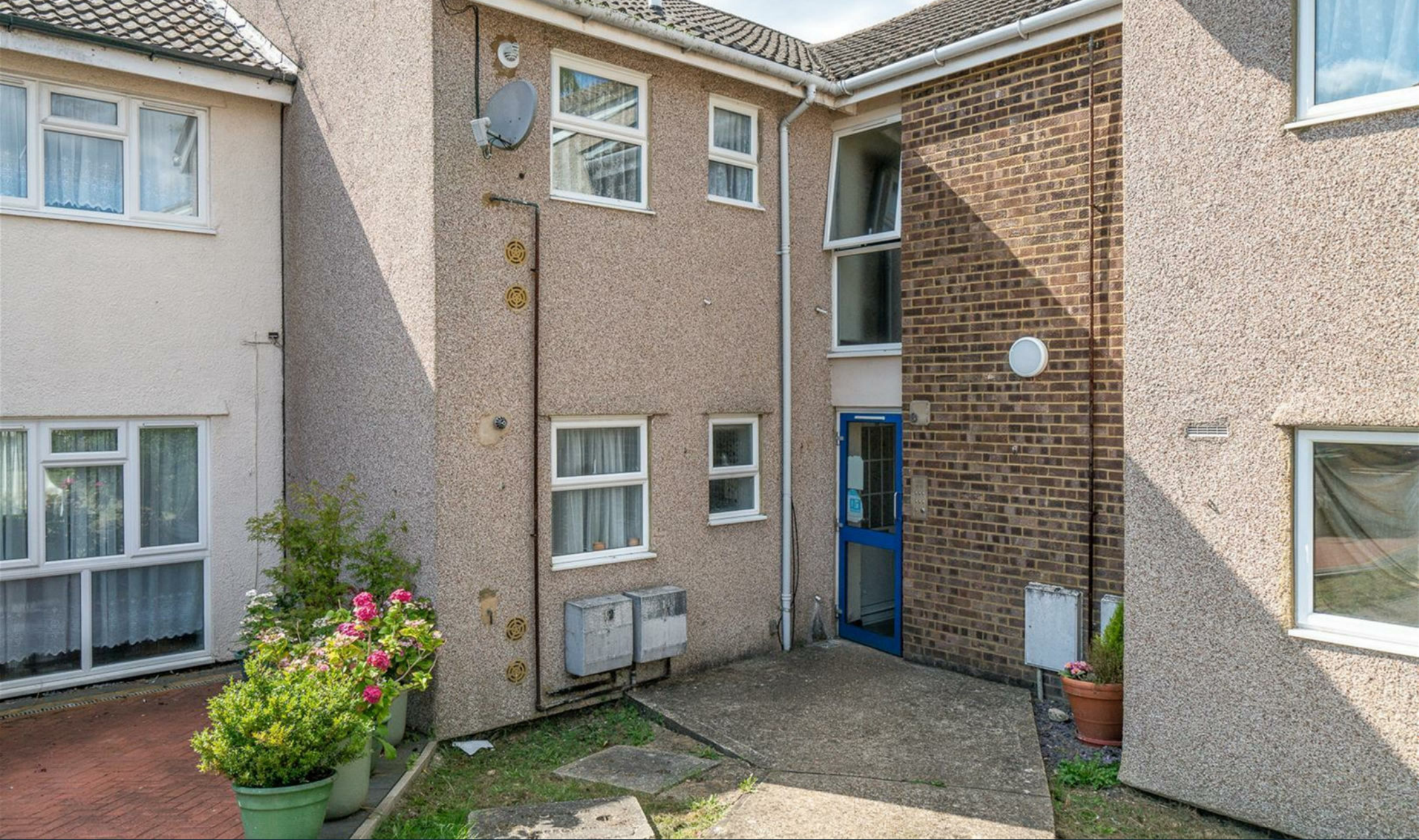
Arran Close Hemel Hempstead, HP3 8TQ