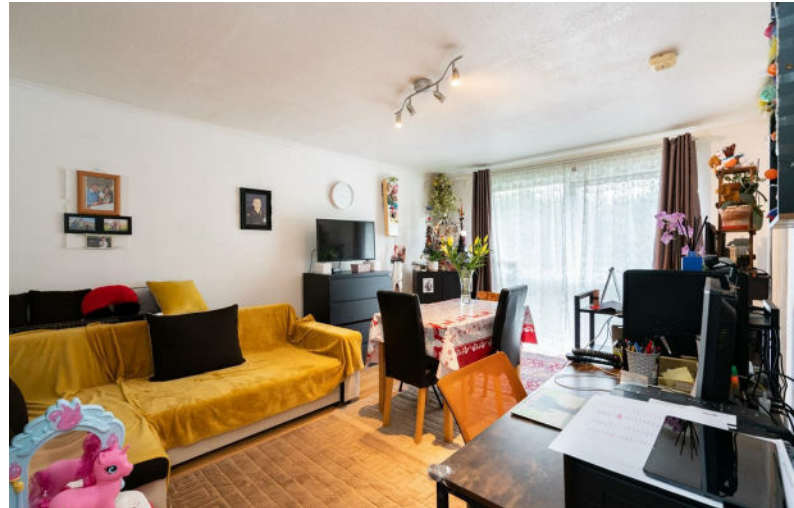
67 Marlowes, Hemel Hempstead, Hertfordshire, HP1 1LE 01442 233533 | www.squirestates.co.uk