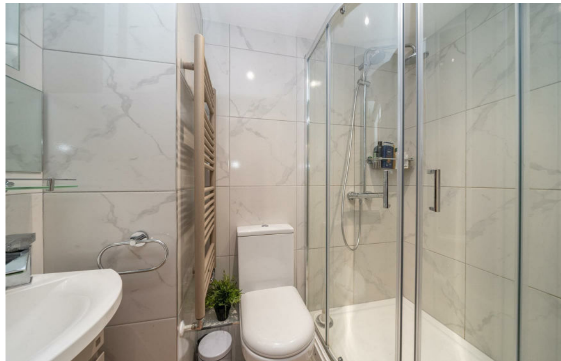
67 Marlowes, Hemel Hempstead, Hertfordshire, HP1 1LE 01442 233533 | www.squirestates.co.uk