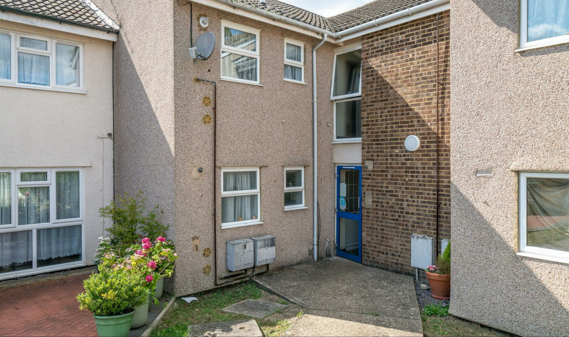
Arran Close Hemel Hempstead, HP3 8TQ