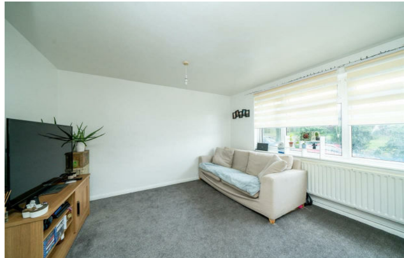
67 Marlowes, Hemel Hempstead, Hertfordshire, HP1 1LE 01442 233533 | www.squirestates.co.uk