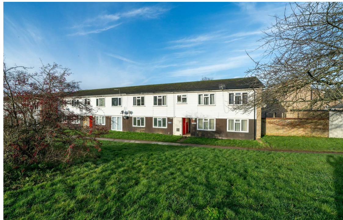
67 Marlowes, Hemel Hempstead, Hertfordshire, HP1 1LE 01442 233533 | www.squirestates.co.uk