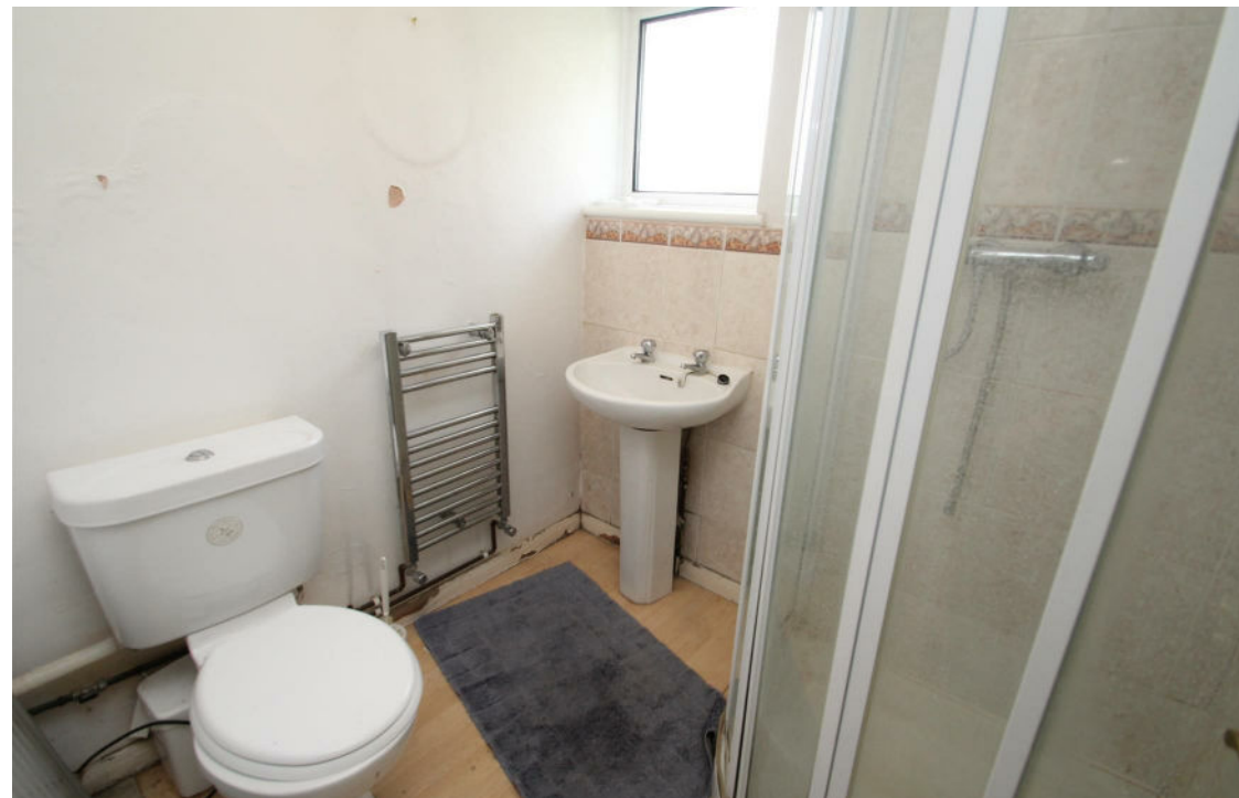
67 Marlowes, Hemel Hempstead, Hertfordshire, HP1 1LE 01442 233533 | www.squirestates.co.uk