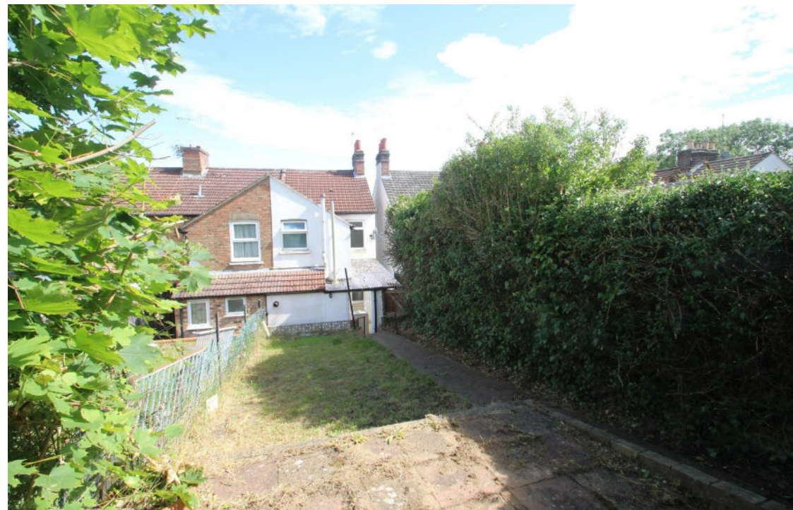
67 Marlowes, Hemel Hempstead, Hertfordshire, HP1 1LE 01442 233533 | www.squirestates.co.uk